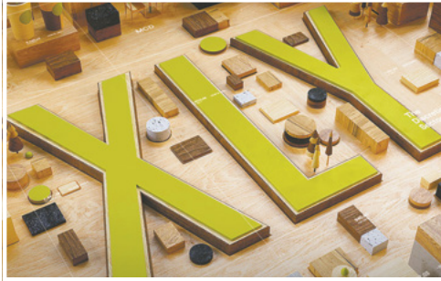
XLY CONSUMER DISCRETIONARY