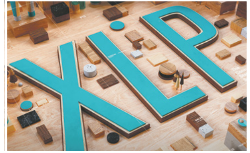
XLP CONSUMER STAPLES