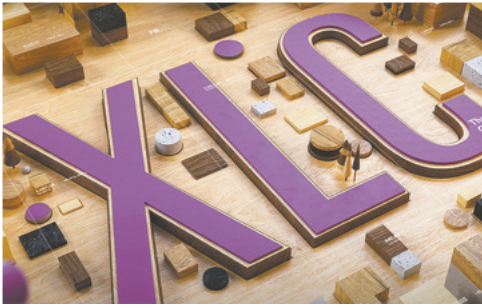
XLC COMMUNICATION SERVICES