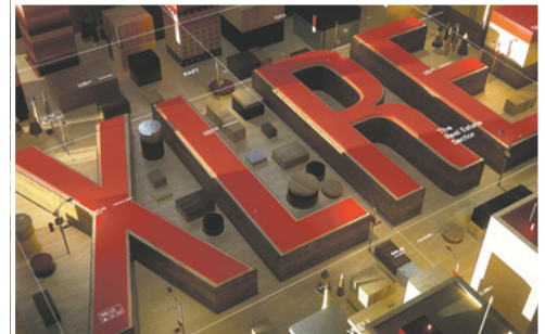
XLRE REAL ESTATE